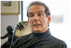
Krauthammer On Benghazi Revelations: This Is A Cover-Up Of... Downtrend