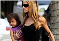
Scary Skinny Stars Hollyscoop