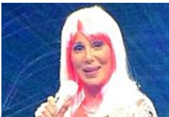
Cher Dares to Wear Pasties at 67 -- Do You Dare Look?... Stirring Daily