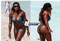
Serena Williams Shows Off Her Bikini Body Bossip

EATER LOS ANGELES a Monica ; P.U.M.P. Lounge Hires Chef, Opening in May