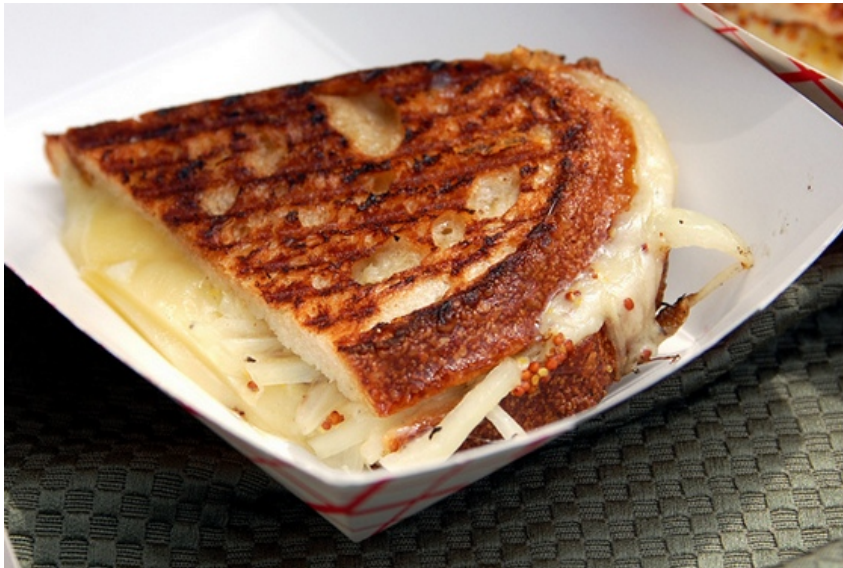
Peel's "Classic" grilled cheese